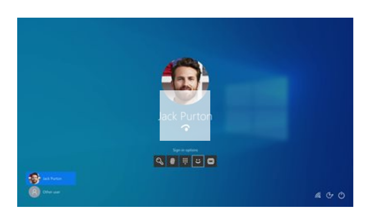
Windows Hello - Security with a smile

Windows 10 Pro simplifies identity, device and application management so you can focus on your business. Flexible management capabilities let you see the big picture and make changes on your schedule. With intuitive control over your IT infrastructure, your business can be ready for anything.