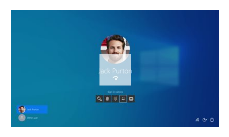
Windows Hello - Security with a smile

Windows 10 Pro simplifies identity, device and application management so you can focus on your business. Flexible management capabilities let you see the big picture and make changes on your schedule. With intuitive control over your IT infrastructure, your business can be ready for anything.